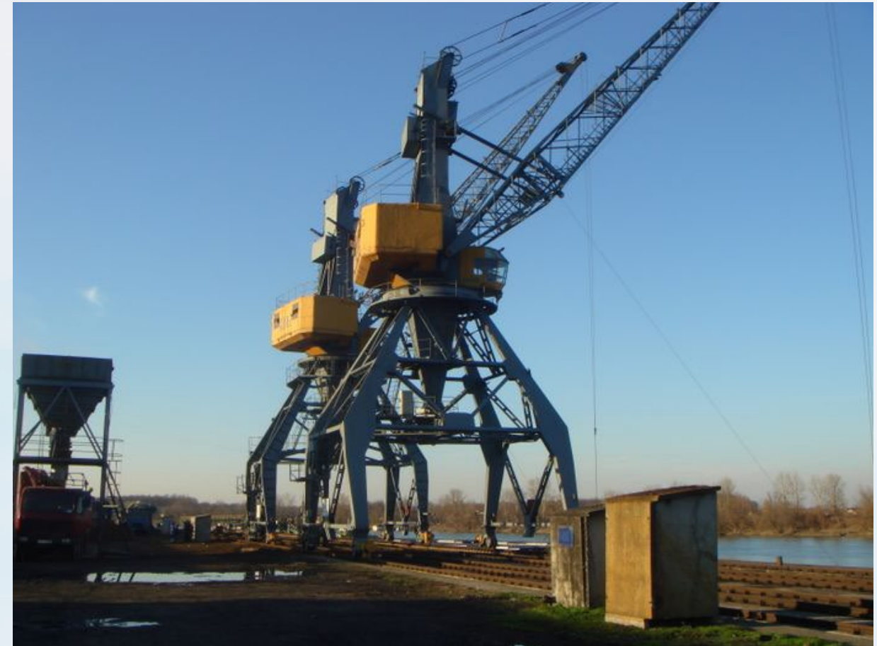
Photos of the Port before the revitalization